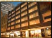
CityLife Wellington A Heritage Hotel