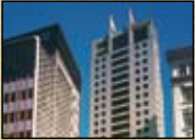
CityLife Auckland A Heritage Hotel