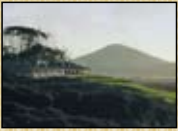
Carrington Resort A Heritage Hotel