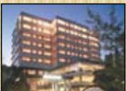
Rutherford Hotel Nelson A Heritage Hotel