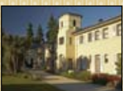
Heritage Hanmer Springs